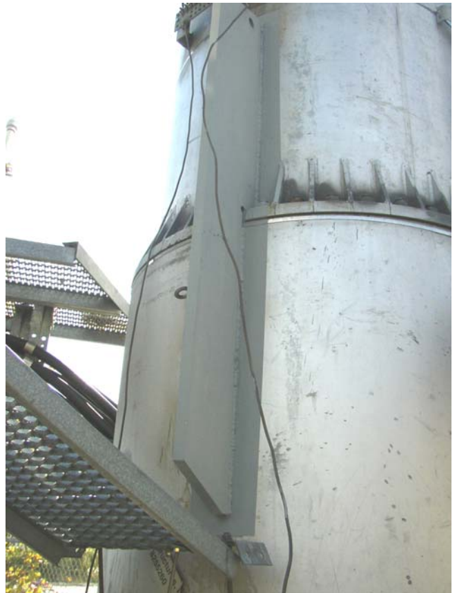
Transition Stiffeners Completed