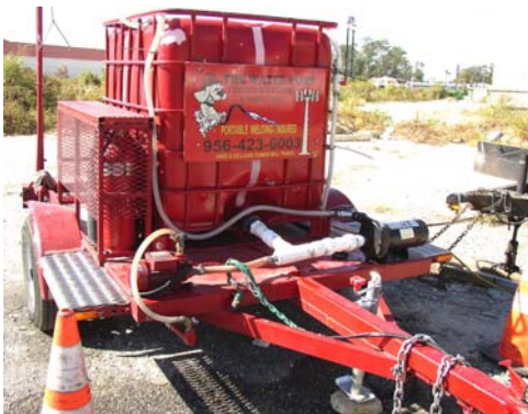
300 gallon Mobile Fire Prevention System.