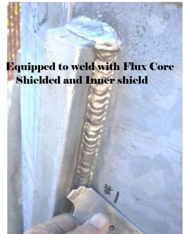
Equipped to weld with Flux Core Shielded and Inner shield