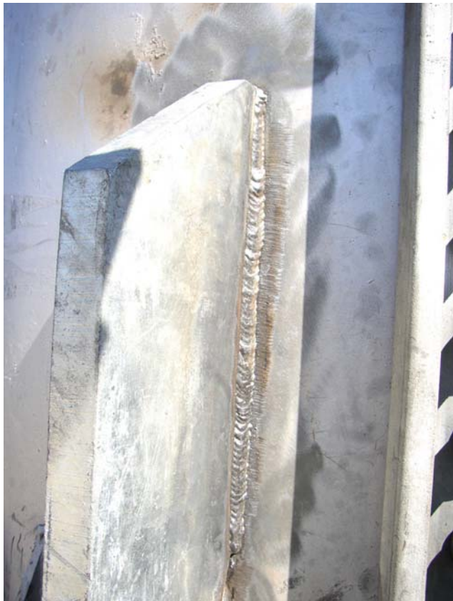
Clean, Tack and Weld Transition Stiffeners