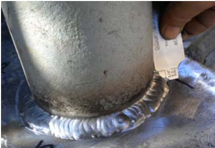
Welding to AWS D1.1 Structural and Welding Specifications.