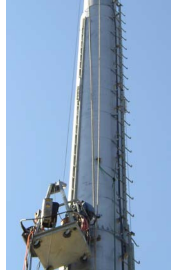
Spider Cage Equipment - 400 ft Range