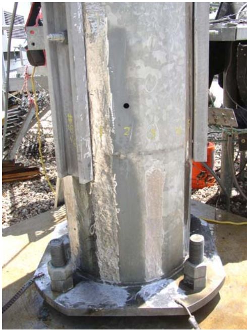
Map Tower, Clean and Grind. Prepare Surface for welding.