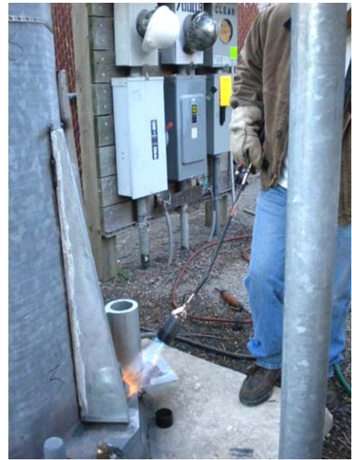
Preheat both stiffeners and base of Tower. Prevents Porosity and weld failure.