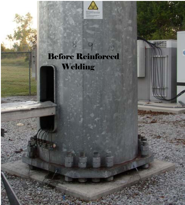
Before Reinforced Welding